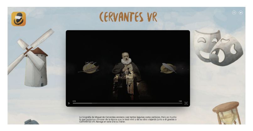
FIGURE 3 SCREENSHOT OF CERVANTES VR AND INGENIERÍA ROMANA TARRACO

Historical event that immerses the user in re-created scenes.