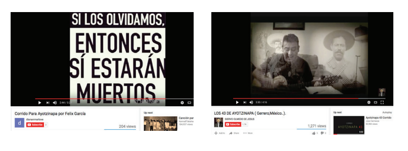
FIGURE 4 STORY-TELLING IMAGES IN PRESENT TENSE