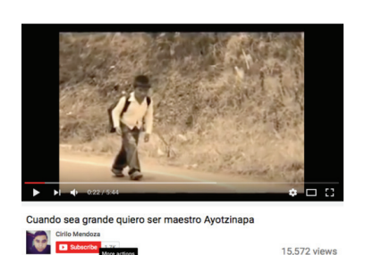
FIGURE 3 STORY-TELLING IMAGES IN PRESENT TENSE

Visuality illustrates both stories, that of the past with images of a poor and rural Mexico emphasised by characterisations of school: children with notebooks and backpacks, young people teaching in rural schools, cold-blooded police repression, graves, deaths and crying mothers (Figure 3).