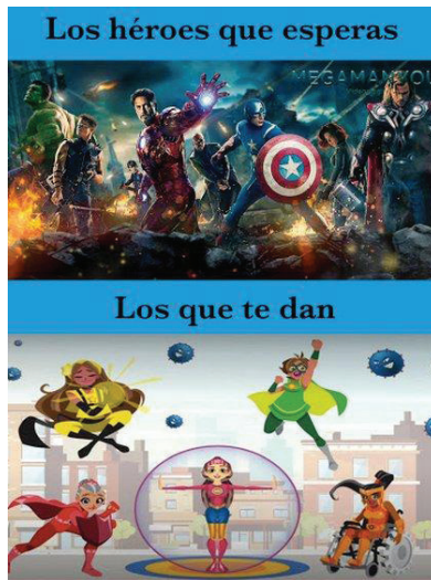
FIGURE 8 THE HEROES THAT YOU EXPECT (TOP) AND THE HEROES YOU ARE SENT (BOTTOM)

The Health Squad received an ice-cold welcome from the Internet memes, and the strategy was widely ridiculed and discredited. Once again, mainstream culture prevailed over the attempts of the Ministry of Health to contribute to semiotic processes that sought to provide a space for the re-valorization of diversity while at the same time