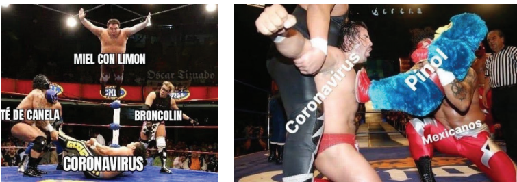
FIGURE 1 MEXICANS AND THEIR WEAPONS AGAINST THE CORONAVIRUS

Other memes alluded to the similarity of the generic name of the virus family to that of Corona beer, whose high levels of international commercialization and widely-recognized advertising campaigns ( En México y el mundo la cerveza es Corona [In Mexico and all over the world, the beer of choice is Corona]) cause a strong association with Mexican identity. Most likely, in many cases, the sharing of these images was merely due to an interest in staying active in socio-digital networks, thus performing the phatic function, which is focused on contact and refers to messages that serve to establish, to prolong, or to discontinue communication, to check whether the channel works (Jakobson, 1981, p. 81). As Pérez Salazar (2017) points out, “sometimes, a person only shares as a form of coexistence, in order to feel that s/he is part of something that is happening at that moment, as a way of announcing that s/he is there too (p. 155, own translation from Spanish).