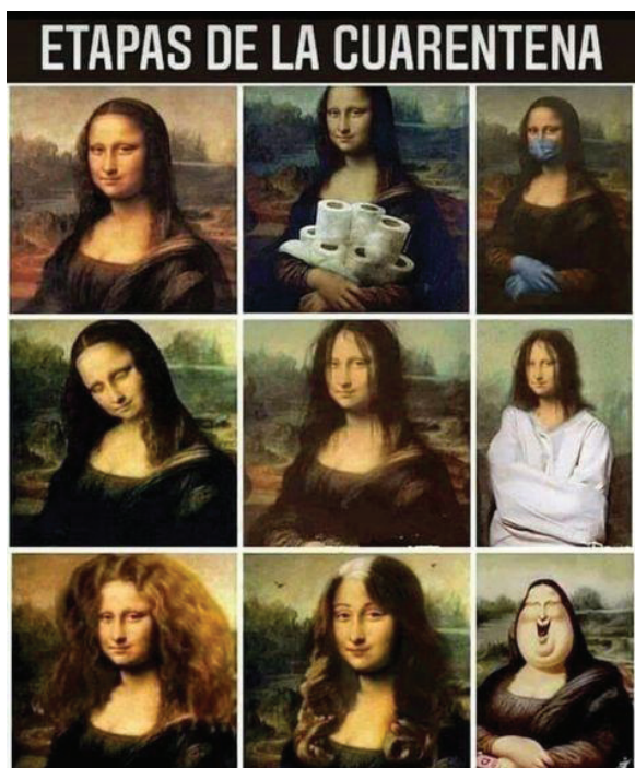
FIGURE 7 THE SOCIAL CONSTRUCTION OF CONFINEMENT

The set is entitled “The stages of quarantine”, with white typeface, all in capital letters, on a black background. Nine successive images of the Mona Lisa are harmonically displayed, beginning with the reproduction of the original painting by Leonardo da Vinci, followed by altered images that give an account of relevant episodes in everyday life. This meme led this researcher to reflect upon Berger and Luckmann’s (2003) approaches to the reality of everyday life, the phenomena of which, those authors write, “are prearranged in patterns that seem to be