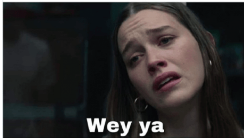
FIGURE 6 A DESPERATE PRAYER. “WEY YA”, MEANS “ENOUGH, MAN” OR “ENOUGH, ALREADY”

Another widely shared meme on socio-digital networks summed up the semiosis generated by quarantine in everyday life. Except for the heading, “The stages of quarantine” (see Figure 6), there is a total absence of verbal resources. The set consists of nine images of the famous Mona Lisa painted by Leonardo da Vinci (the Mona Lisa was itself considered a meme, even before the existence of Internet memes),