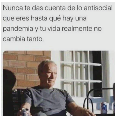
FIGURE 5 "ANTISOCIALS" AND THE PANDEMIC

The semiosis generated by the pandemic were fueled by shared emotions, among which fear played a major part. As the weeks and later the months passed, the year 2020 began to become imbued with a dystopian hue, where both real and false information were considered definitive proof of the coming of the end of the world, e.g. floods and killer bee attacks, and for some inhabitants of Mexico City, the earthquake that occurred on the morning of June 23 rd , 2020, was the ultimate misfortune.