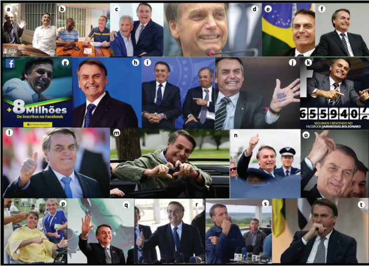
FIGURE 3 BUFFONISH BODY PHOTOMONTAGE