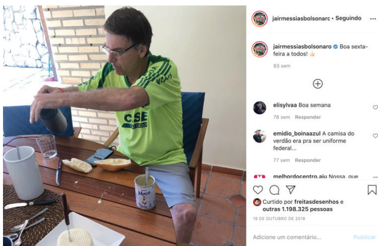
FIGURE 7 BOLSONARO'S BREAKFAST

It is enough to see the image posted on October 19 th , 2019 (Figure 7), to realize that the popular body uses simplicity and authenticity to inscribe, imitate and reinforce the stereotypical imaginary of the Brazilian common man.