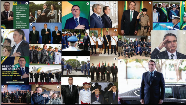
FIGURE 2 MILITARY BODY PHOTOMONTAGE