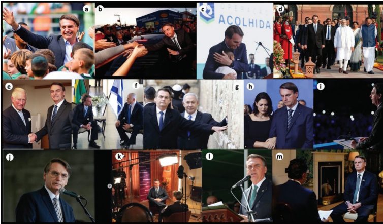
FIGURE 5 INSTITUTIONAL BODY PHOTOMONTAGE