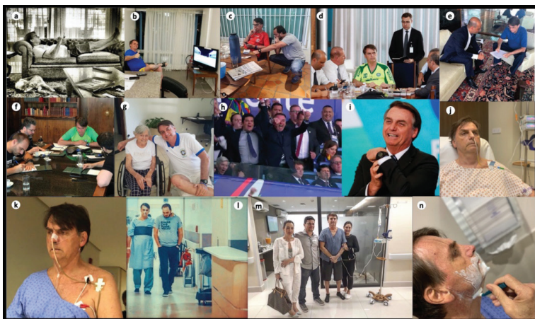
FIGURE 6 POPULAR BODY PHOTOMONTAGE