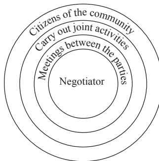
FIGURE 1 CCNP STRATEGY